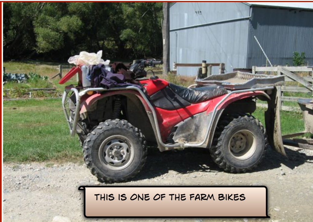
THIS IS ONE OF THE FARM BIKES